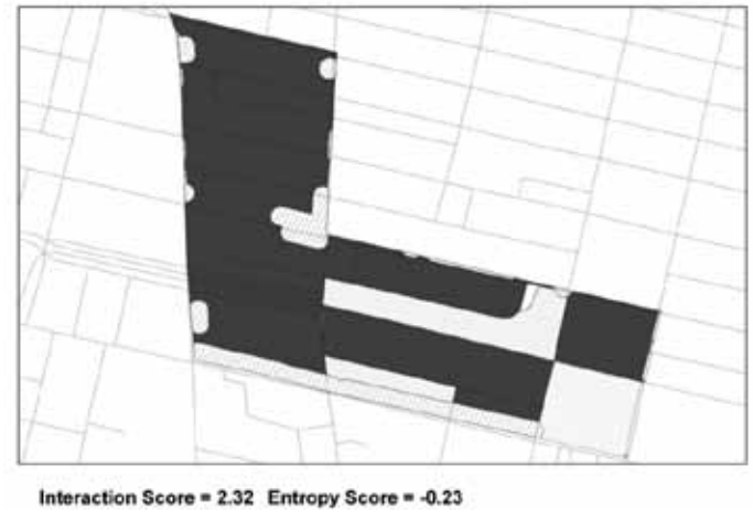
Figure 4 Close-ups of two census tracts showing methodological discrepancies

area. In this manner, a census tract with residential and commercial uses adjoining one another will score higher than one with these land uses being distant.