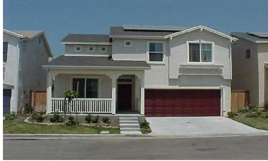
Figure 6. Home in Village Green