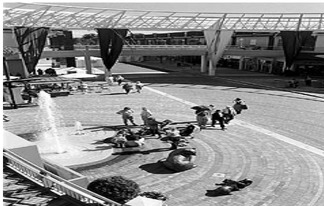
Figure 9. The Village at Overlake Station Town Center.