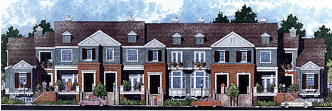
Figure 3. Rowhouses in Orenco Station.

The review of Orenco Station showed although the residents were not typically riders of transit prior to living in the TOD community, according to Dan Zack, the author of “Don’t Pick on Portland”, after moving into Orenco Station, they ride the light rail quite frequently (Zack, Dan, 2002). Further, Orenco Station is designed with walkability in mind. It is designed so that every resident can reach the town center within a five-minute walk. As the residents travel to the town center, the walk is made interesting by the specialty shops, businesses and restaurants along the way. This makes Orenco Station a poster child for TOD, as it meets the precise definition of TOD. This once commercially planned community, is now a functional life-size replica of a mixed use community within walking distance of a transit stop.