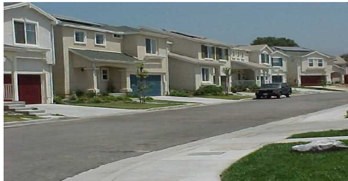
Figure 7. Village Green Transit Oriented Community

(Source: California Transit Oriented Development Database, 2001).