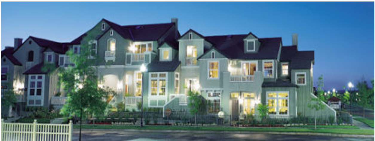
Figure 2. Condominiums in Orenco Station (Source: Orenco Station News, 2002).