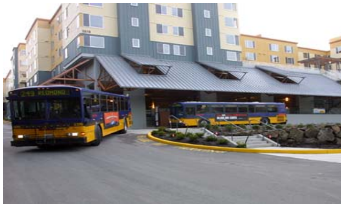
Figure 8. The Village at Overlake Station.

Illustrations 8 and 9 are photos of The Village at Overlake Station. Following the illustrations is a summary table of key characteristics observed during this research process.