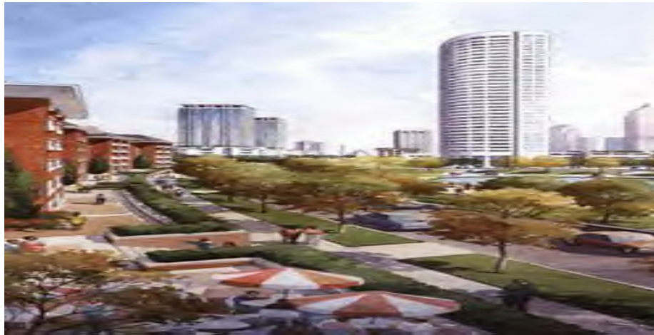
Figure 4. Illustration of Atlantic Station.

The cost to build the Atlantic Station project is listed at approximately $2 billion, with the homes in the community costing approximately $250,000 to $650,000 (Atlanta Journal-Constitution, 2002). Below are illustrative photos of Atlantic Station, followed by table 8, which summarizes the key characteristics of the TOD community.